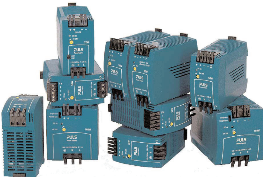
MiniLine switched-mode power supplies for the DIN rail, 25 - 100W , 5 - 48 V

Although the number of primary-switched power supplies available on the market grows daily, not all of them are fit for the requirements of these demanding applications. A combination of high efficiency and ergonomic design puts PULS in the lead. Higher efficiency means longer product life and improved MTBF; ergonomic design means faster installation and servicing, while spring-loaded clamps maintain reliable long-term connections. These are all valuable properties, not just for industrial equipment, but particularly in the construction of lifts.